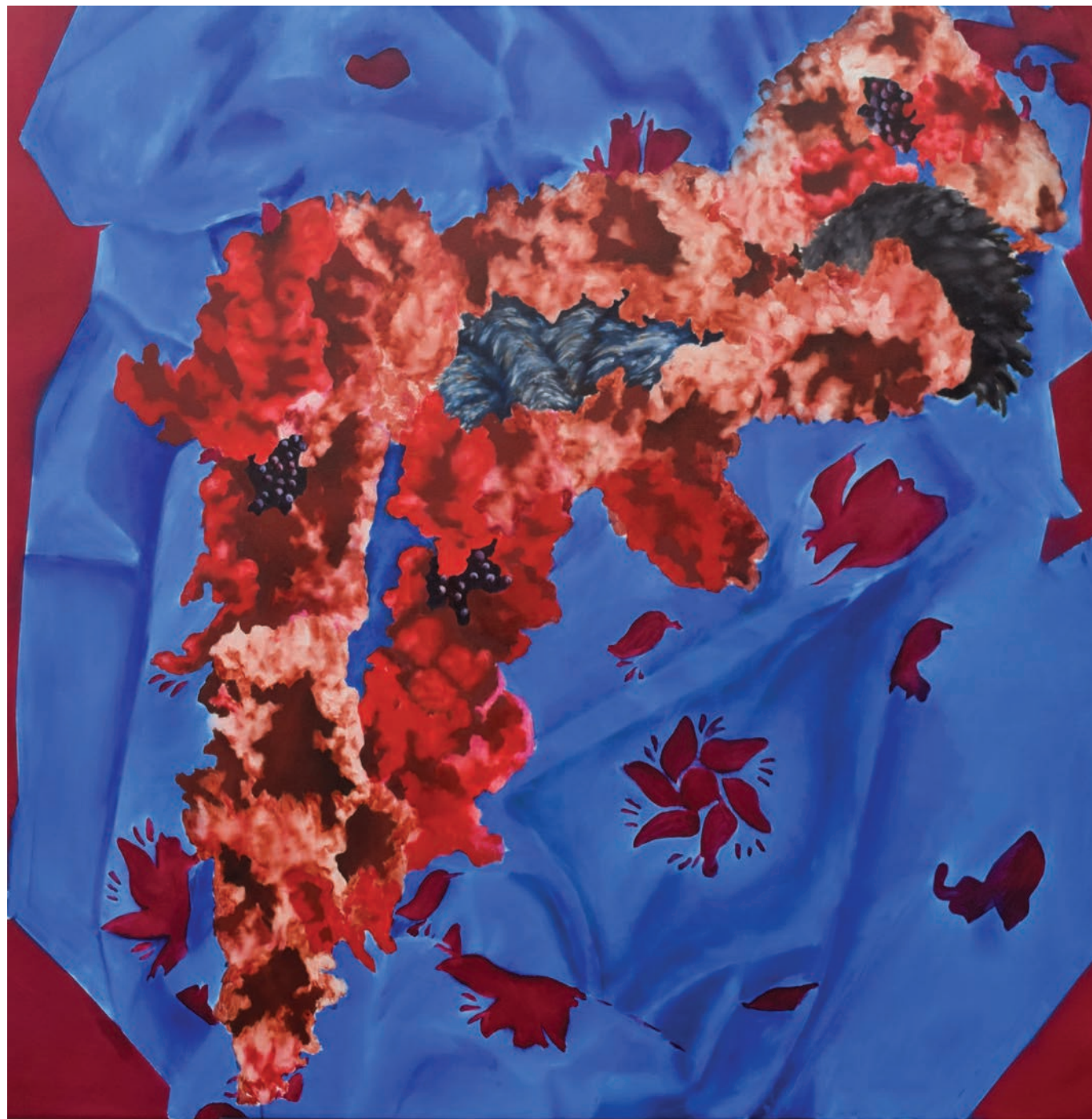
How to be, 2018, oil on canvas, 1x1m