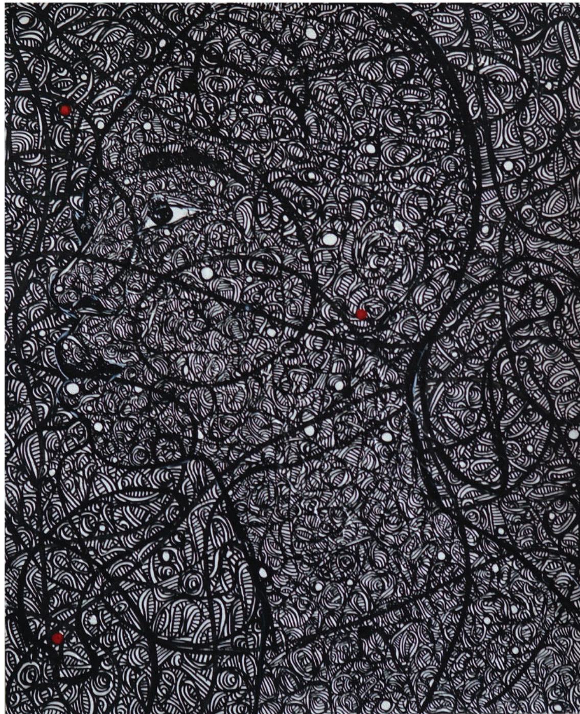
I See you from a distance series 50 x 65 cm #007, 2017