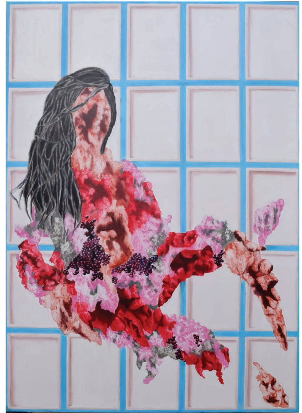
Face Me, 2017, oil on canvas, 1x1.4m