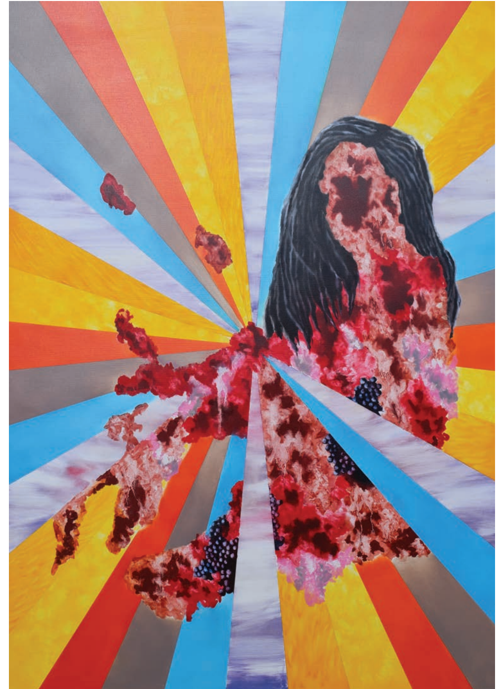
I Face You, 2017, oil on canvas, 1x1.4m