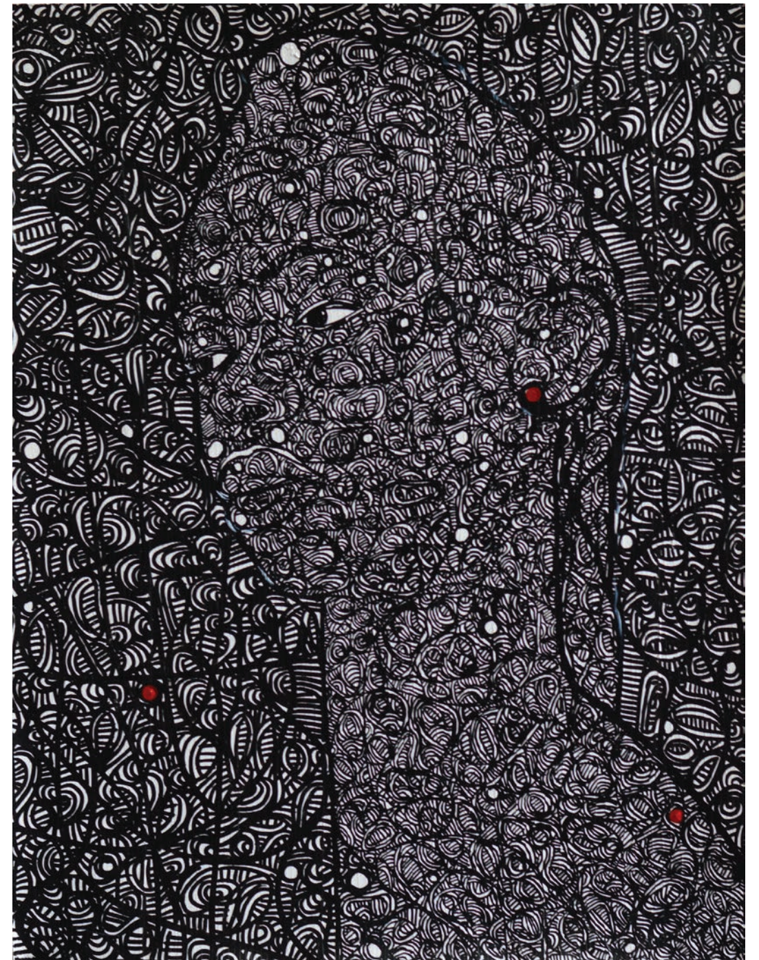
I See you from a distance series 50 x 65 cm #008, 2017