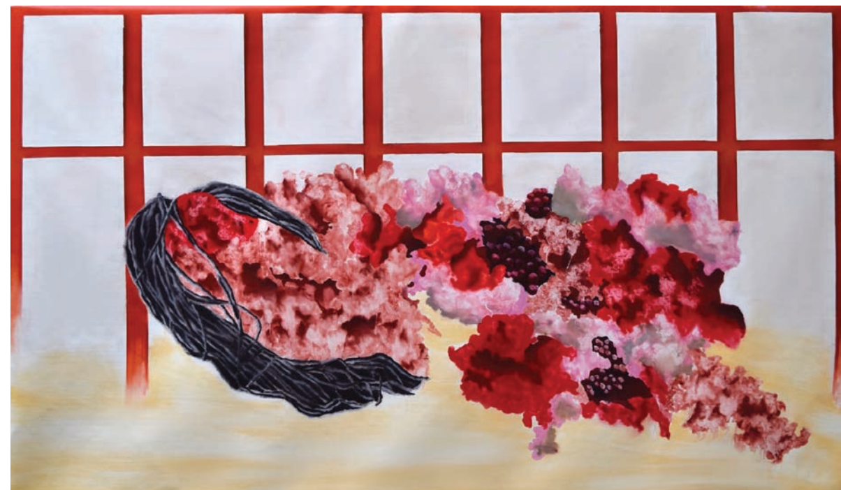
How to be, 2018, oil on canvas, 1x1m