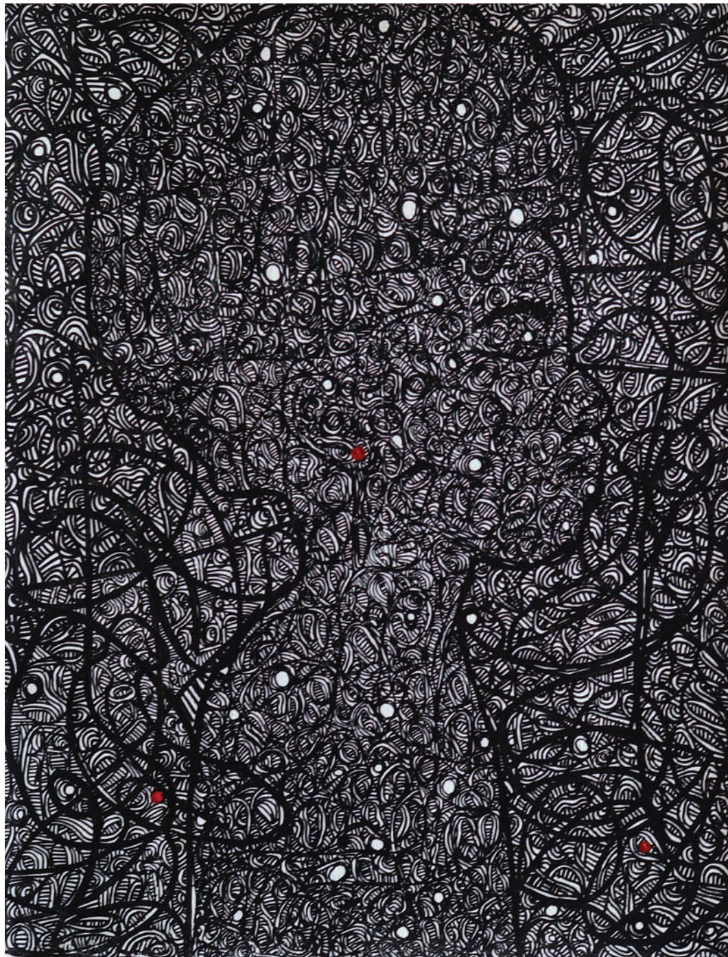
I see you from a distance series 50 x 65 cm #0010, 2017