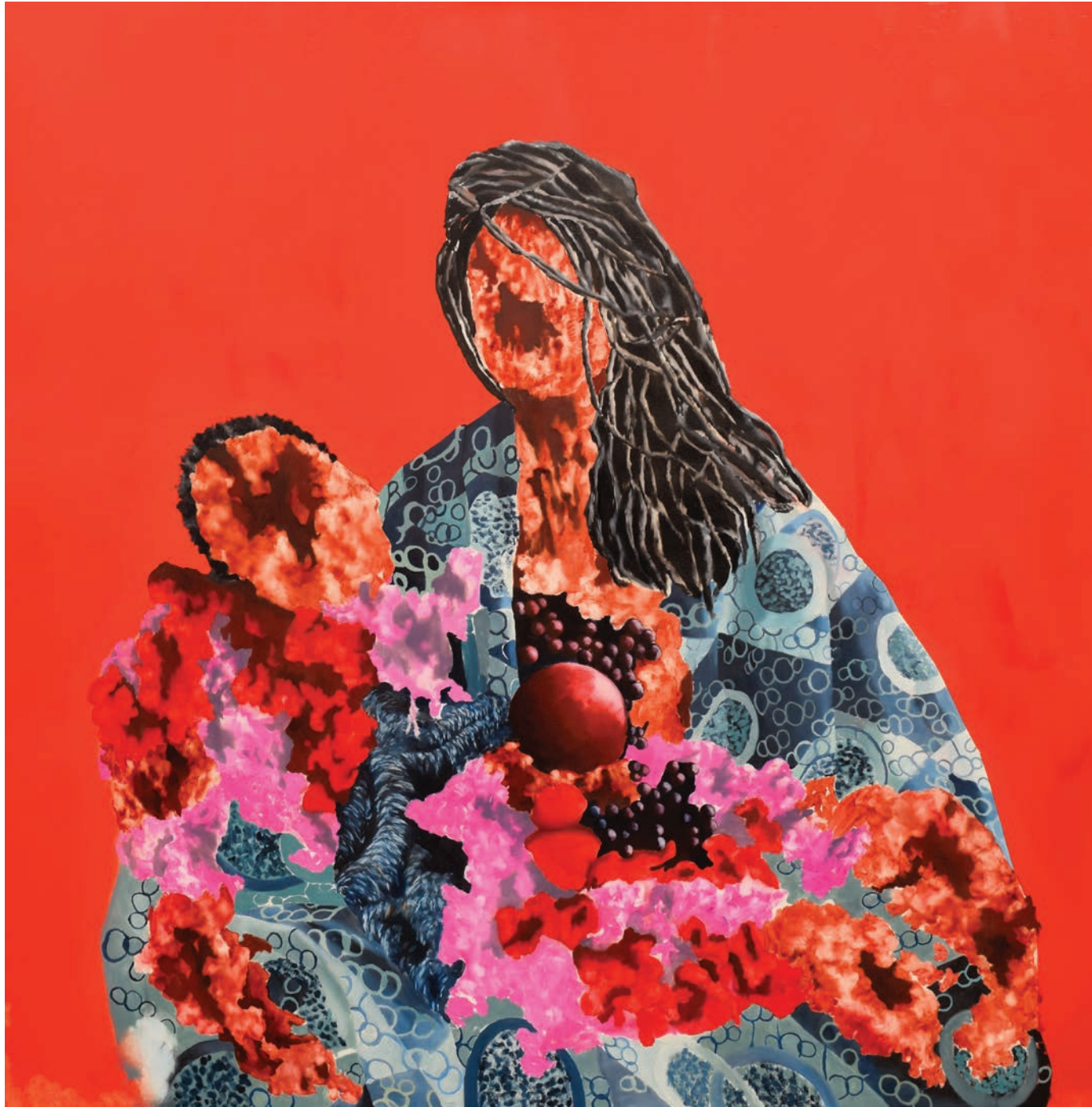
On low cut, 2018, oil on canvas, 1.5 x1.5m