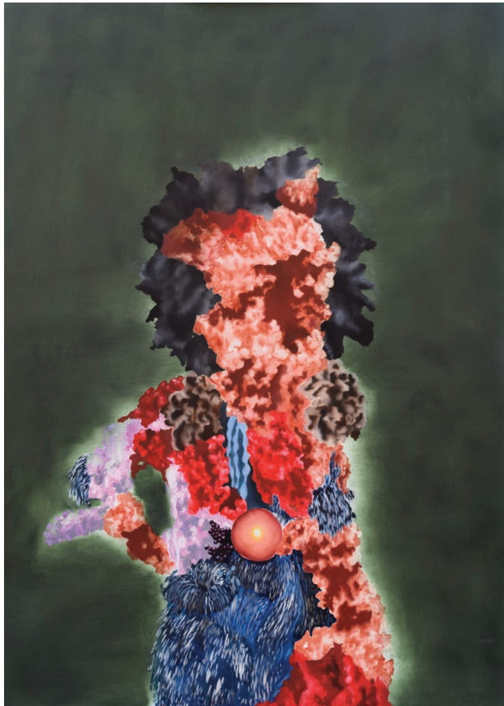
Akimbo, 2018, oil on canvas, 1x1.4m