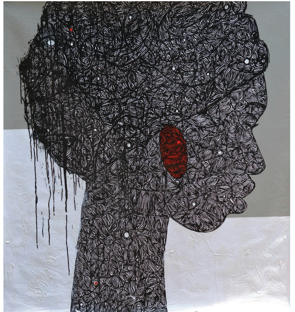
I see you from a distance series 125 x 135 cm #001, 2017