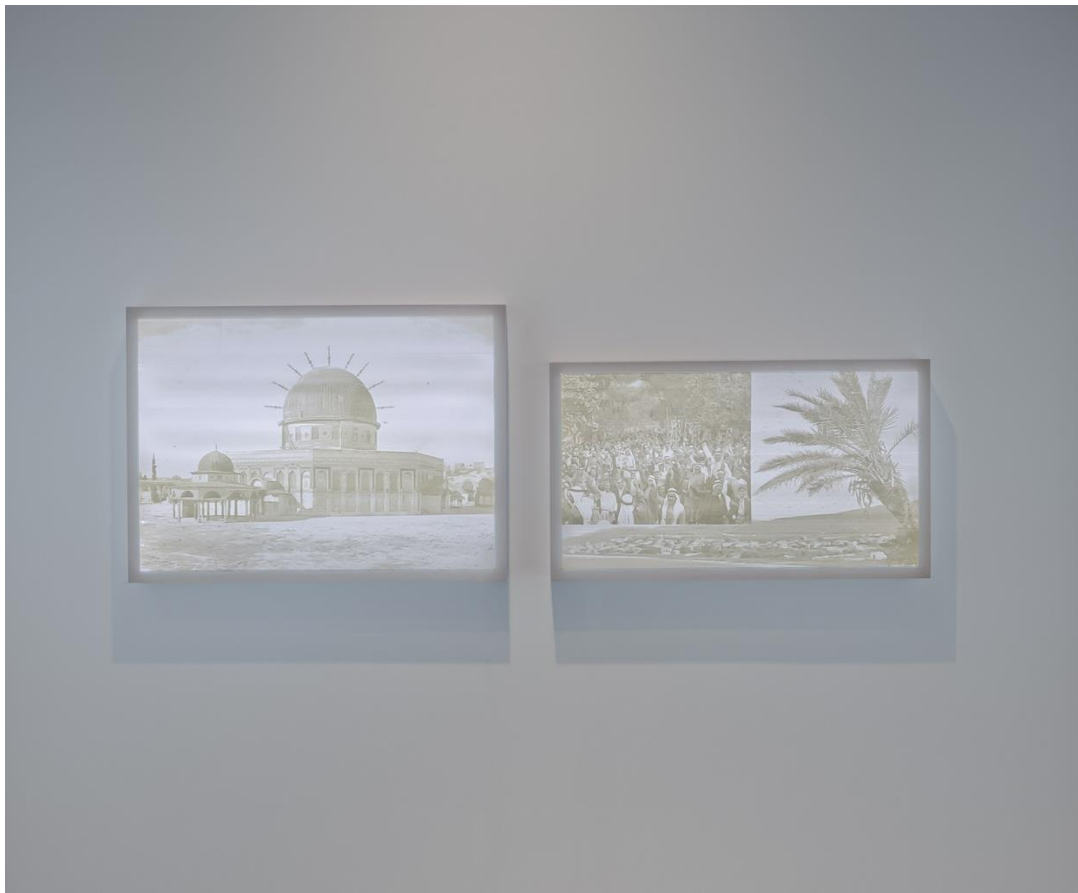
Hazem Harb Shade of Memory , 2020

Engraved light-boxes from archival photography