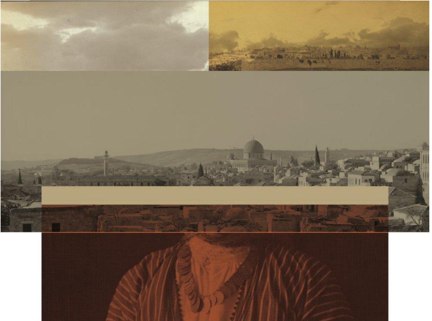
Hazem Harb The Place is Mine, Series #5, 2018

Collage of archival fine art C-P photography on MDF wood. Geometric shapes frame, in sculpture content. Unique 150 x 120 x 5 cm 59 1/8 x 47 1/4 x 2 in $ 20,000.00