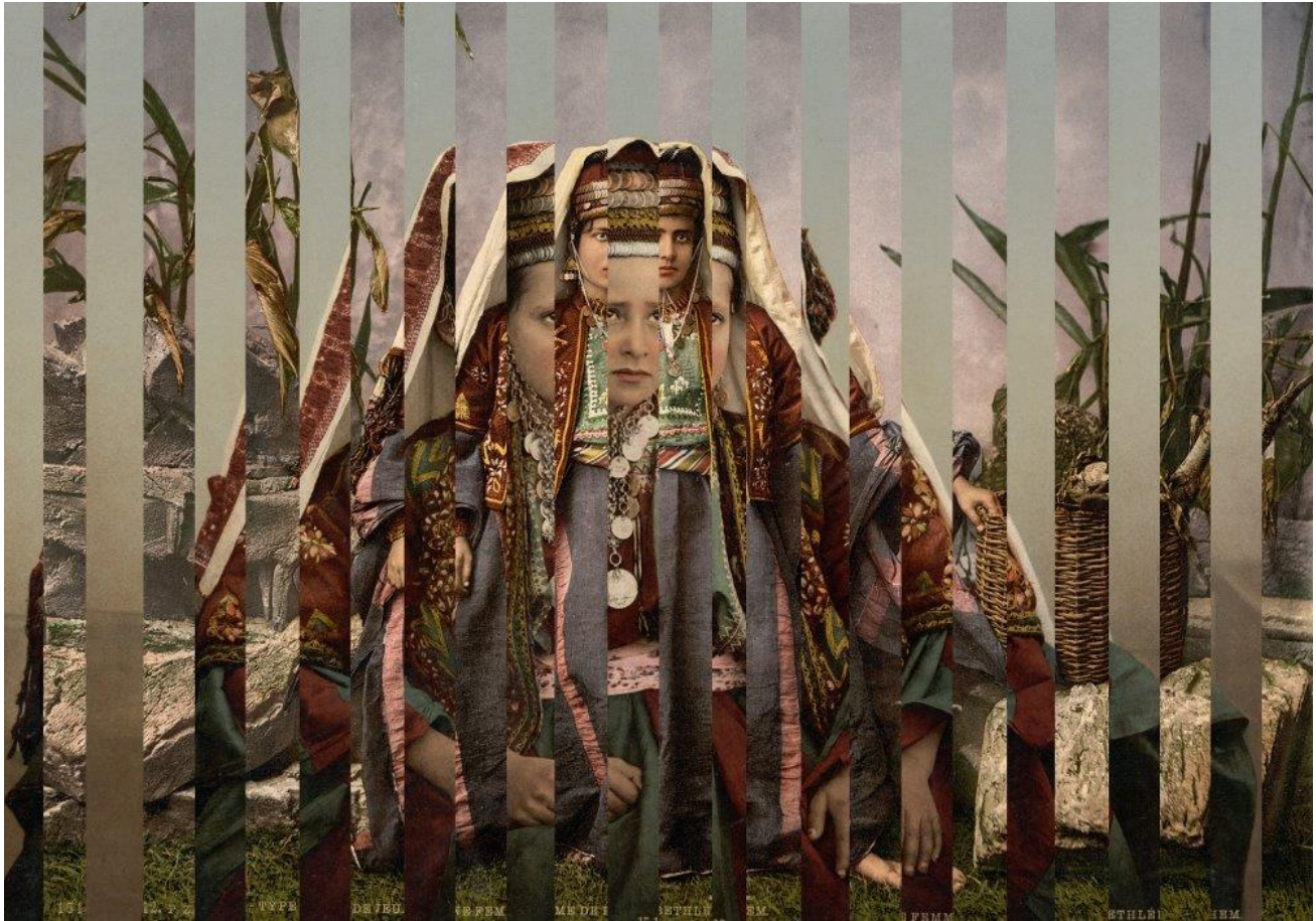
Hazem Harb The Silk Line of Identity , 2020

Layers of collage of archival Fine Art C-P photography on MDF wood. Diptych