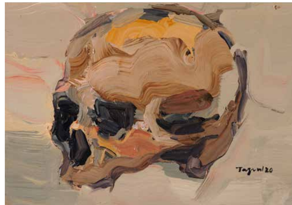
From the series Lips & Skulls (2020) Acrylic on paper, 21 x 30 cm