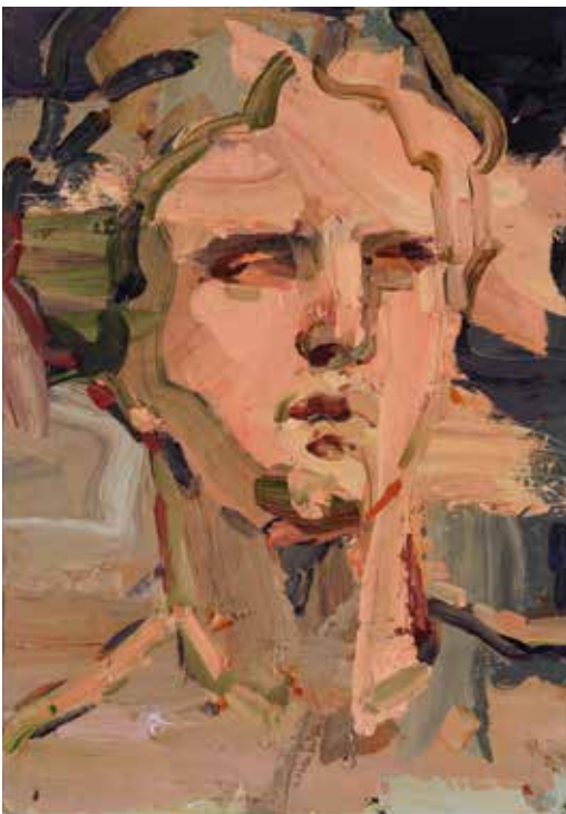
From the series Venuses & Aphrodites (2020) Acrylic on paper, 42 x 30 cm