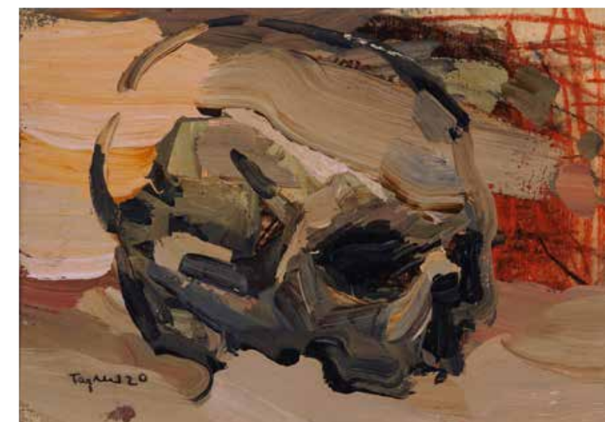
From the series Lips & Skulls (2020) Charcoal and acrylic on paper, 21 x 30 cm