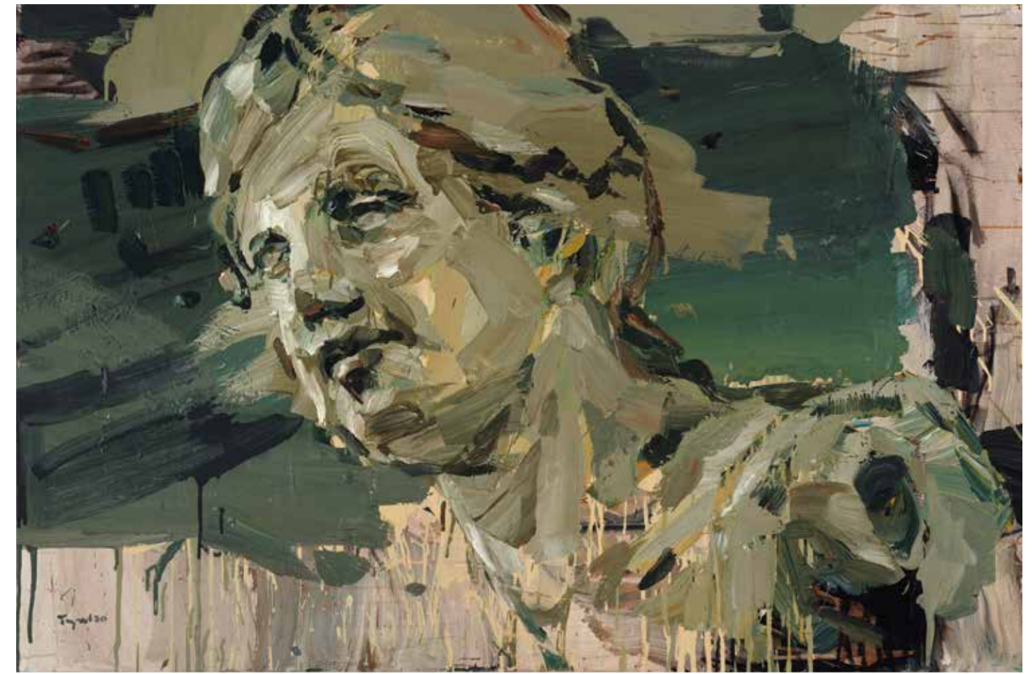
From the series Venuses & Aphrodites (2020) Acrylic on canvas, 100 x 150 cm

shape and reinforce limiting and dominant visions of gender. Darghouth, who regularly connects far-flung influences from literature, philosophy and music to her personal experiences in the modern world now turns to Greek mythology as her point of departure.