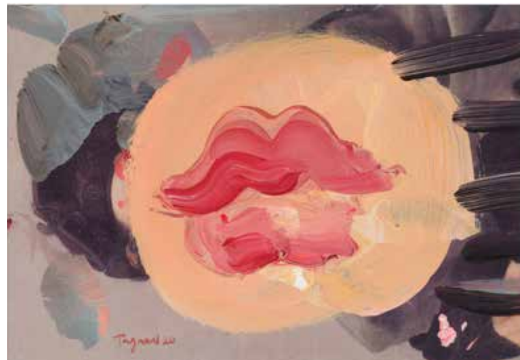
From the series A tribute to Asger Jorn (2020) Acrylic on postcard, 10 x 19 cm