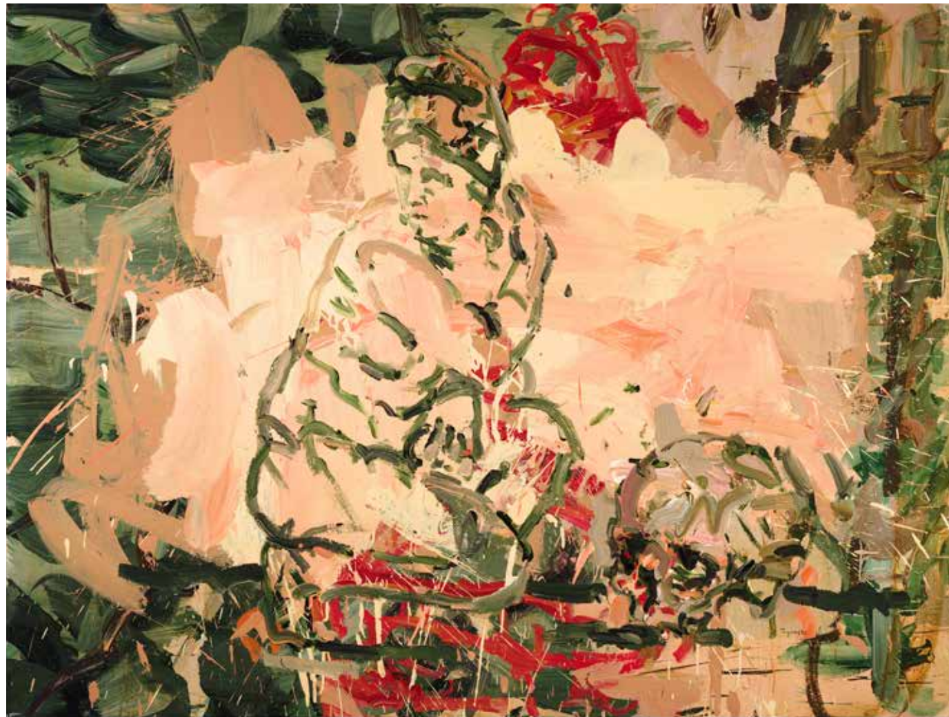
From the series Venuses & Aphrodites (2020) Acrylic on canvas, 200 x 150 cm

Pandora was the fabled first woman to be constructed in ancient Greek society and unleashed with unrivalled physical beauty and immense sexual allure. The artist, probes the fabricated nature and superficiality of Pandora, a woman over whom Aphrodite 'spilled grace' and whose destiny was to become "an evil men will love to embrace". Conflating the classical with the contemporary throughout this body of work; Pandora, Darghouth reasons, is a myth but so too is the