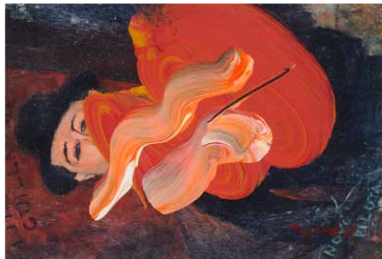
From the series A tribute to Asger Jorn (2020) Acrylic on postcard, 10 x 19 cm