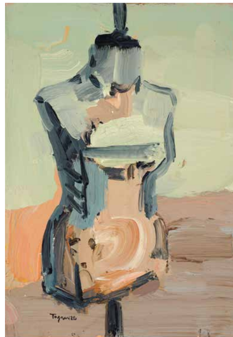
From the series Floral Dummies (2020) Acrylic on paper mounted on canvas, 42 x 30 cm