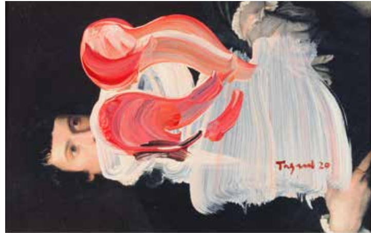
From the series A tribute to Asger Jorn (2020) Acrylic on postcard, 10 x 19 cm