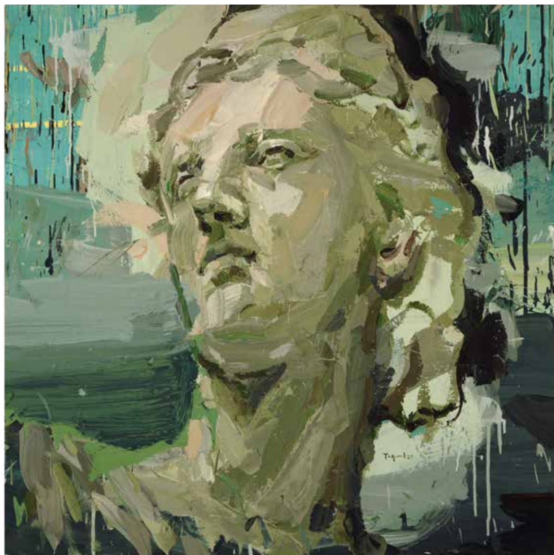
From the series Venuses & Aphrodites (2020) Acrylic on canvas, 120 x 120 cm