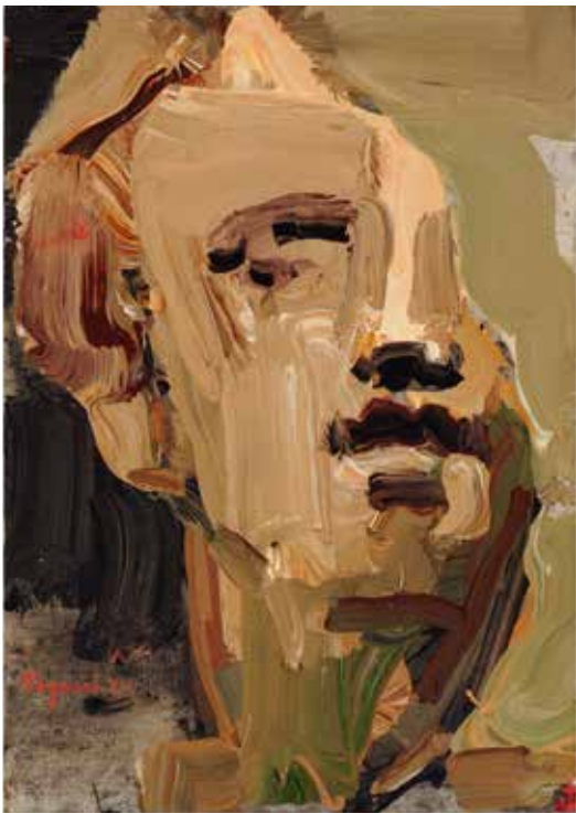
From the series Venuses & Aphrodites (2020) Acrylic on paper mounted on canvas, 30 x 21 cm