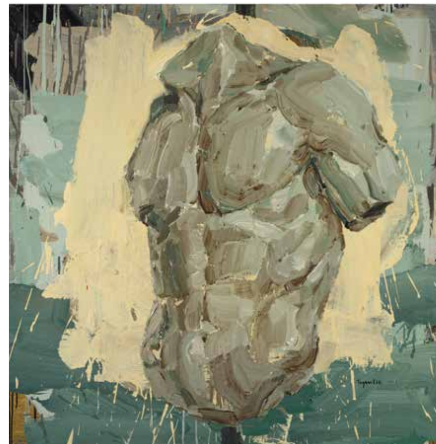
From the series Greek Male Bust (2020) Acrylic on canvas, 120 x 120 cm