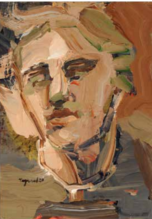
From the series Venuses & Aphrodites (2020) Acrylic on paper mounted on canvas, 30 x 21 cm