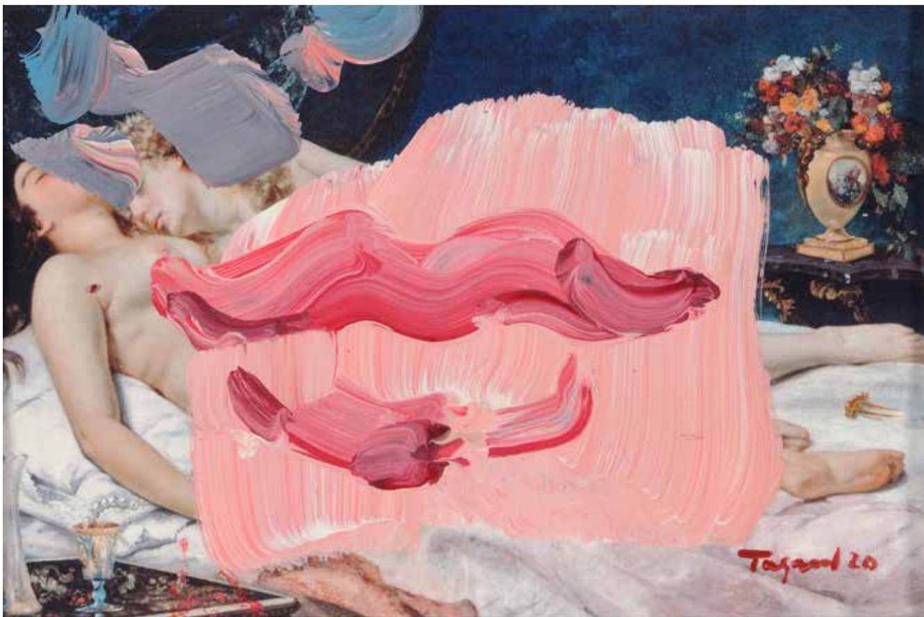
From the series A tribute to Asger Jorn (2020) Acrylic on postcard, 10 x 19 cm