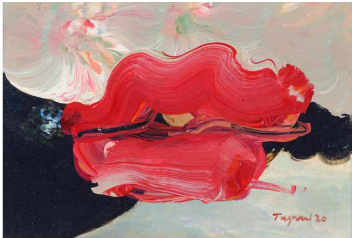
From the series A tribute to Asger Jorn (2020) Acrylic on postcard, 10 x 19 cm