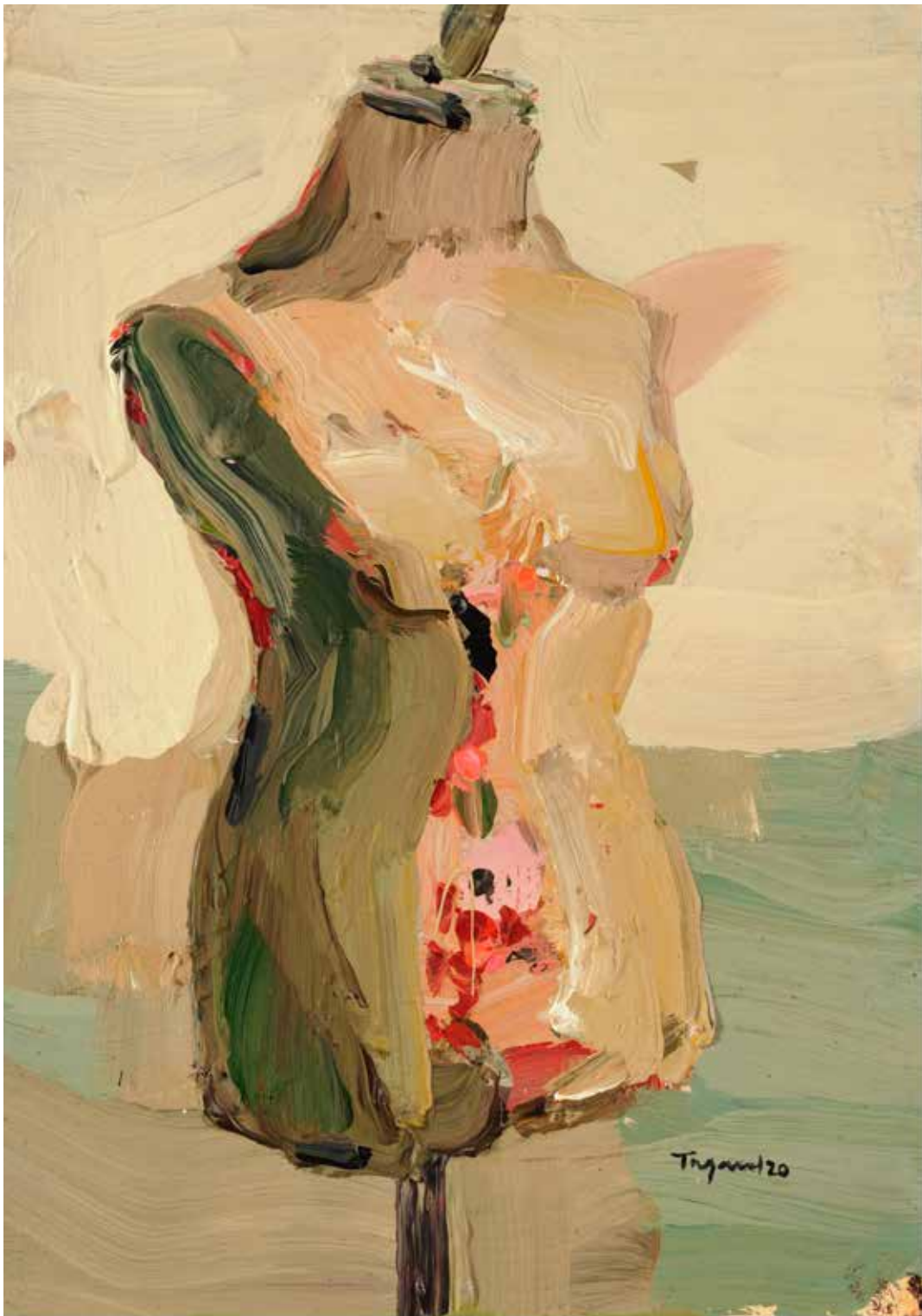
From the series Floral Dummies (2020) Acrylic on paper mounted on canvas, 42 x 30 cm