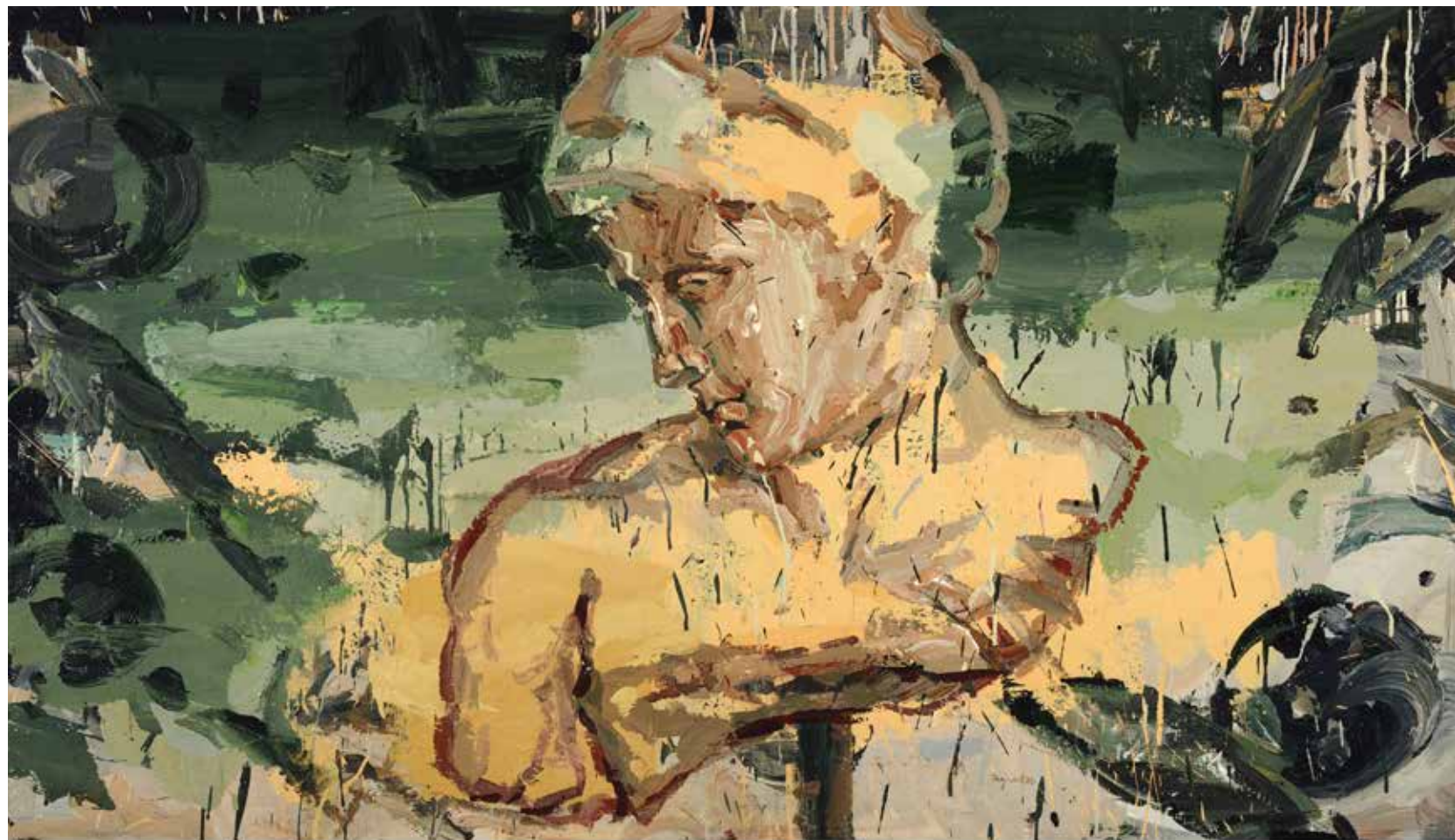
From the series Venuses & Aphrodites (2020) Acrylic on canvas, 117 x 200 cm