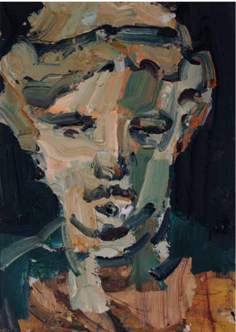
From the series Venuses & Aphrodites (2020) Acrylic on paper, 42 x 30 cm