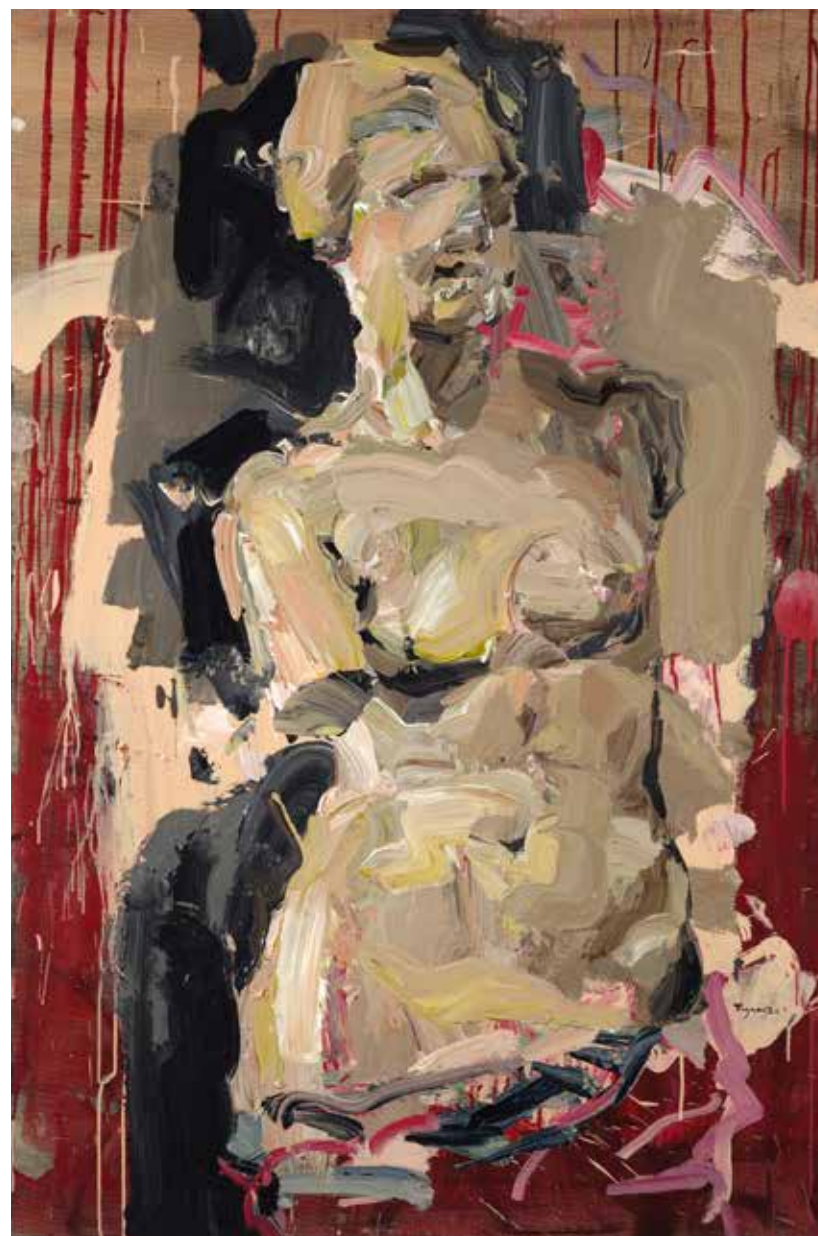
From the series Venuses & Aphrodites (2020) Acrylic on canvas, 150 x 100 cm