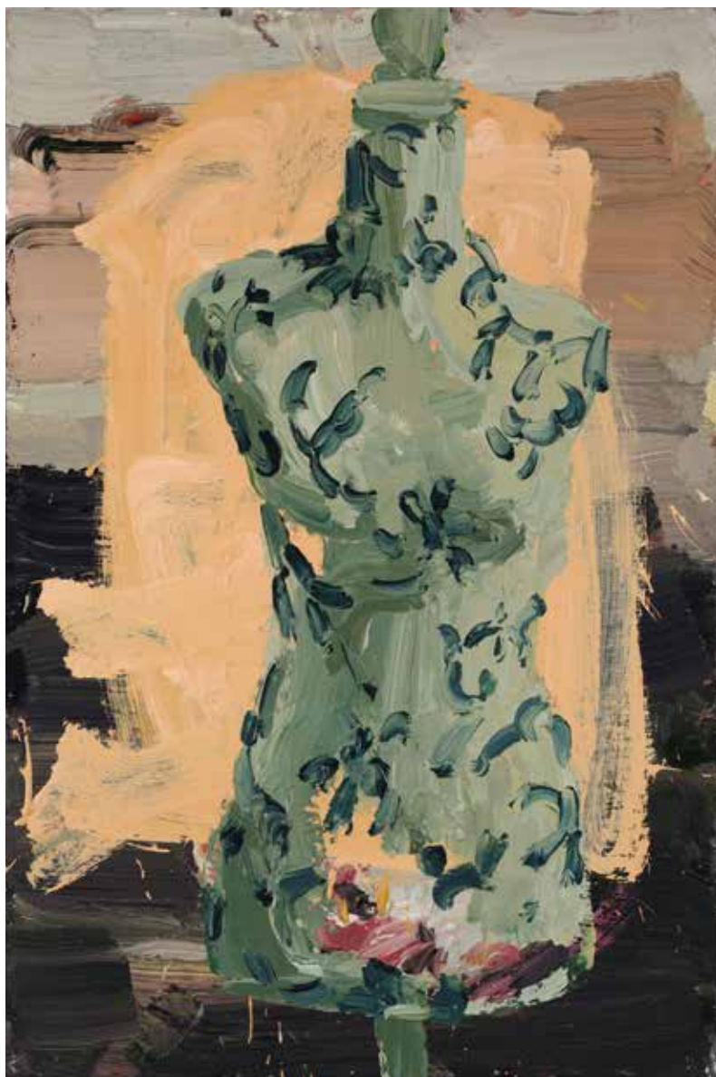
From the series Floral Dummies (2020) Acrylic on canvas, 60 x 50 cm