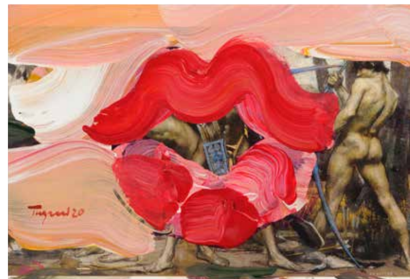
From the series A tribute to Asger Jorn (2020) Acrylic on postcard, 10 x 19 cm