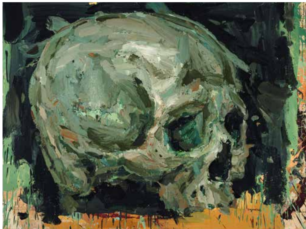
From the series Uncanny Lover skull series (2020) Acrylic on canvas, 150 x 200 cm