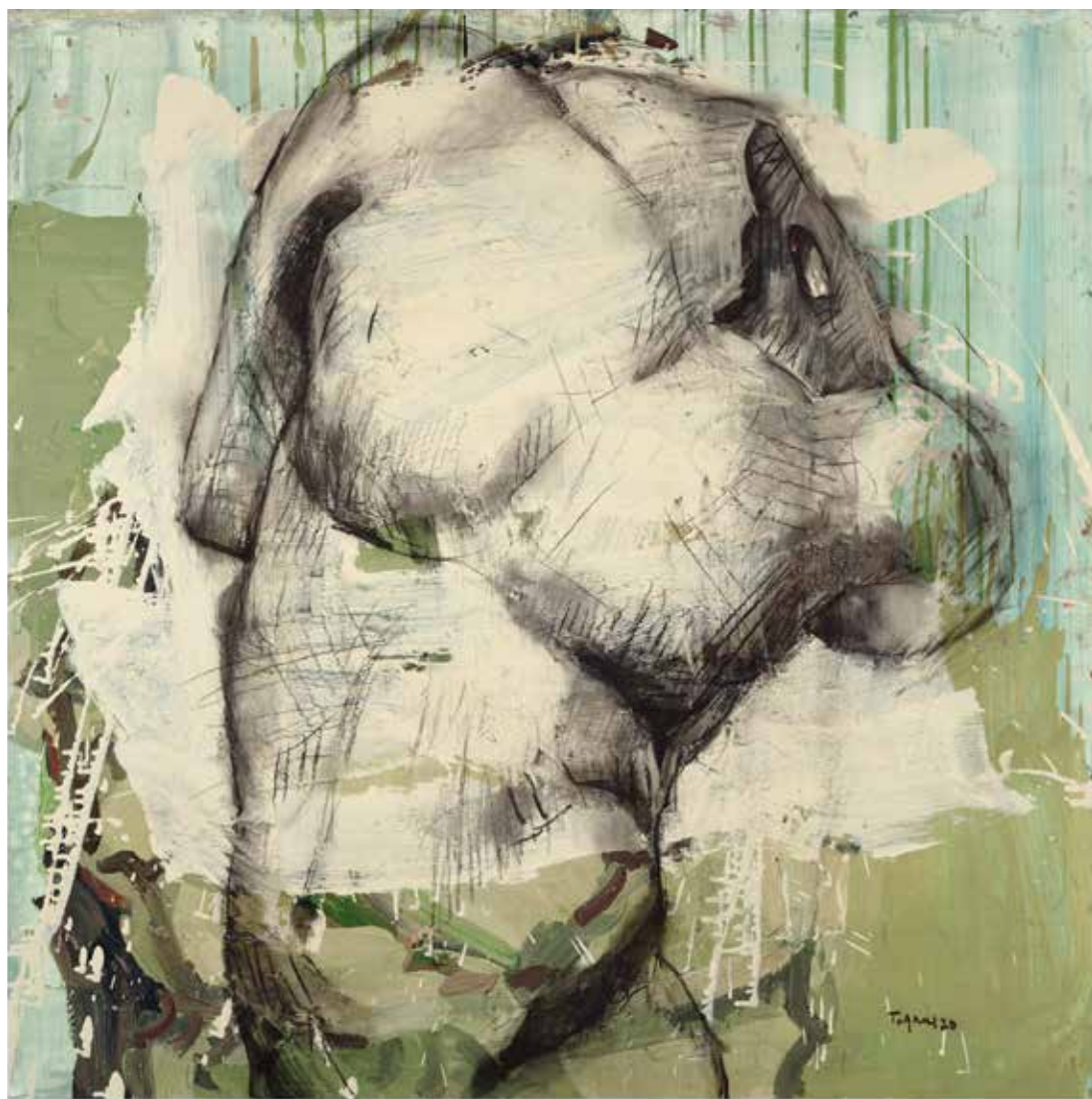
From the series Greek Male Bust (2020) Acrylic and charcoal on canvas, 120 x 120 cm