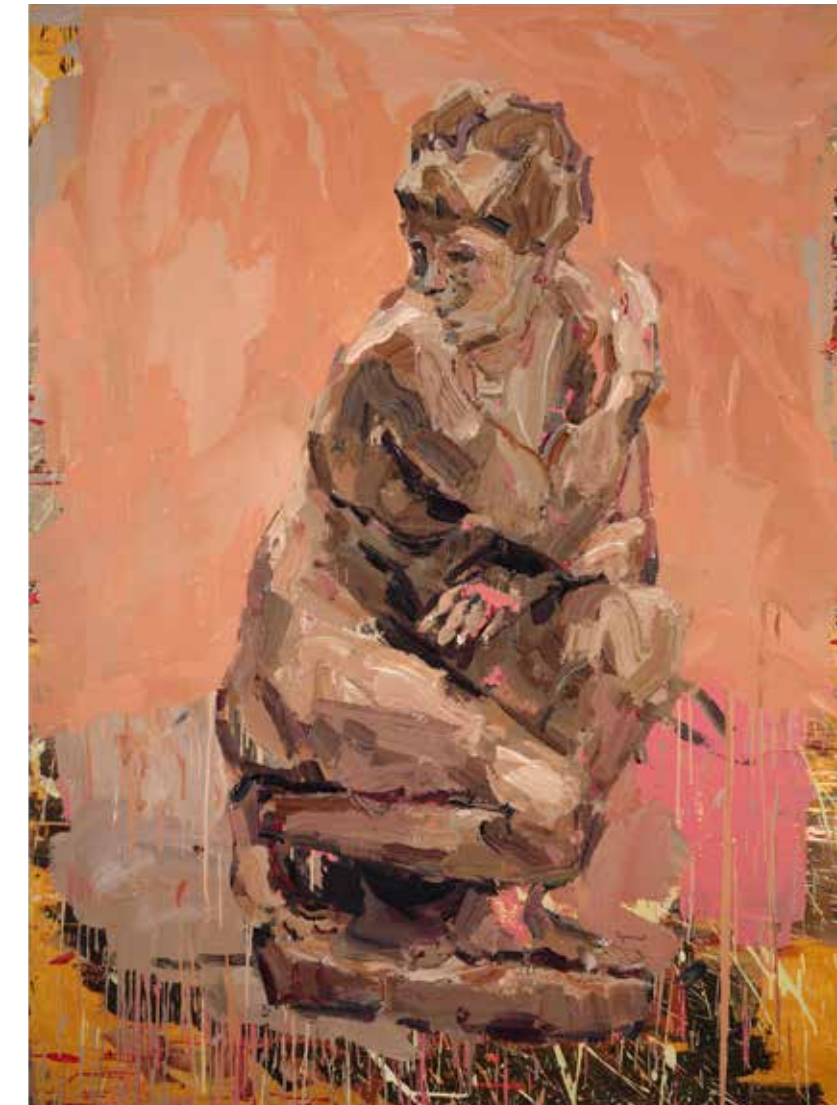
From the series Venuses & Aphrodites (2020) Acrylic on canvas, 150 x 100 cm

its unattainable standards of beauty and perfection. Those standards have since become central to women’s identity and men’s status. In other words it “spilled grace” over a doll’s head to become the toy all little girls want to have, the body all women desire to achieve, and the fantasy all men love to embrace.”