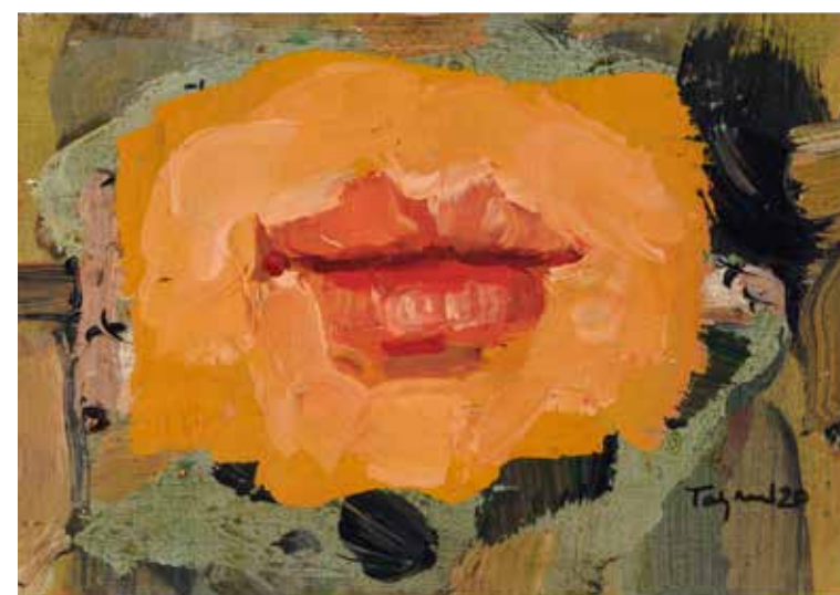
From the series A tribute to Asger Jorn (2020) Acrylic on postcard, 10 x 19 cm