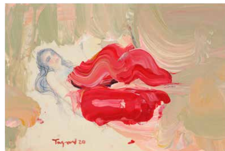
From the series A tribute to Asger Jorn (2020) Acrylic on postcard, 10 x 19 cm