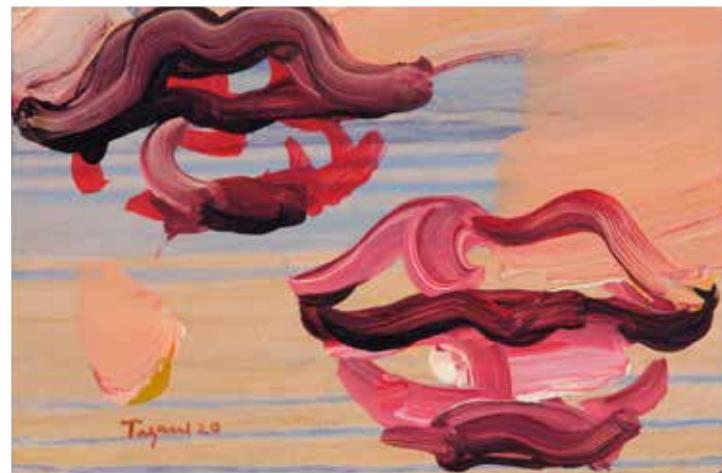
From the series A tribute to Asger Jorn (2020) Acrylic on postcard, 10 x 19 cm