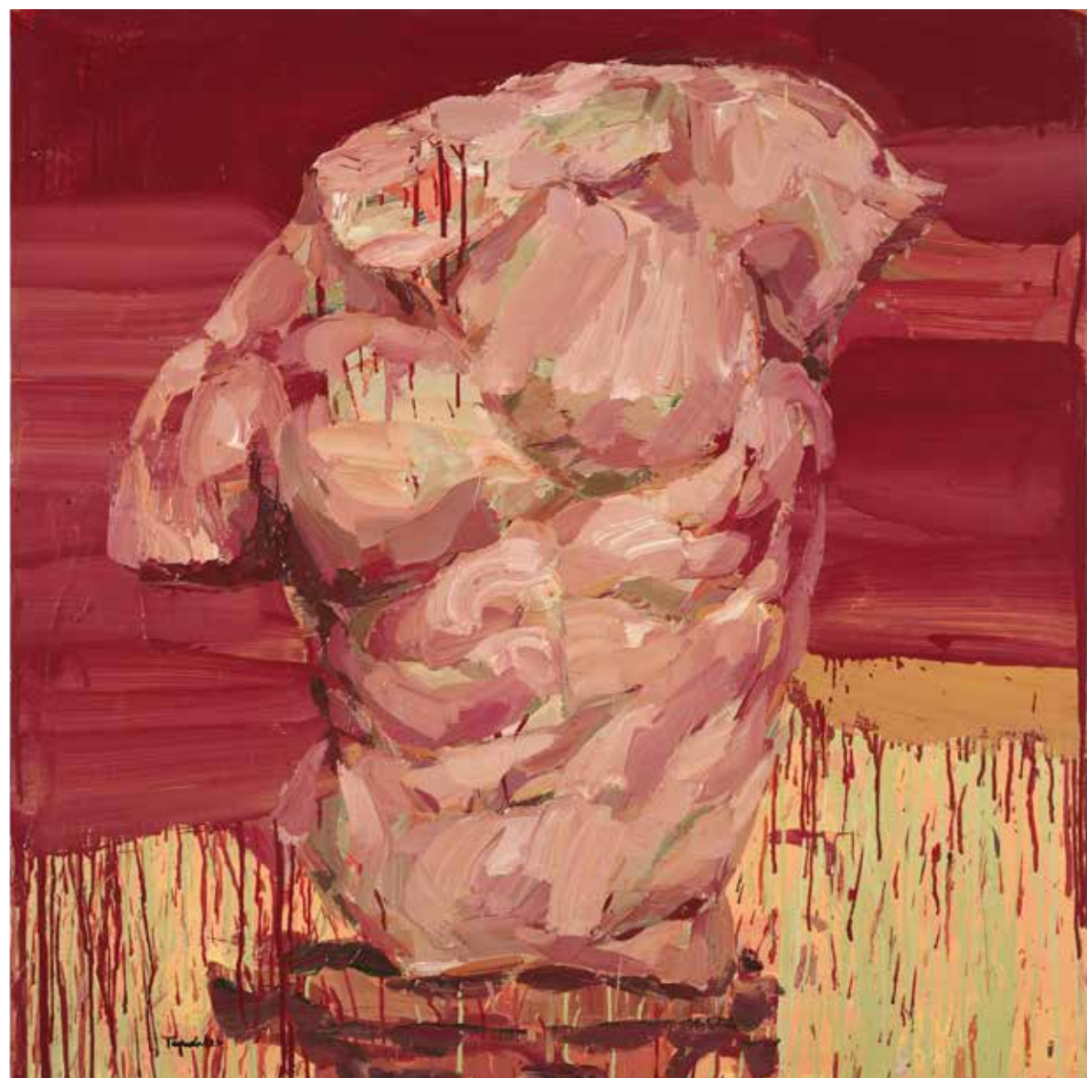
From the series Greek Male Bust (2020) Acrylic on canvas, 120 x 120 cm