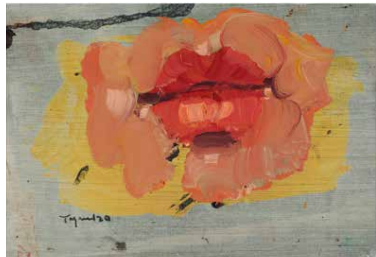
From the series A tribute to Asger Jorn (2020) Acrylic on postcard, 10 x 19 cm