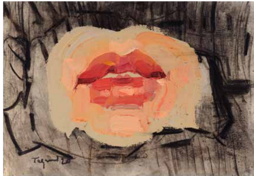
From the series A tribute to Asger Jorn (2020) Acrylic on postcard, 10 x 19 cm