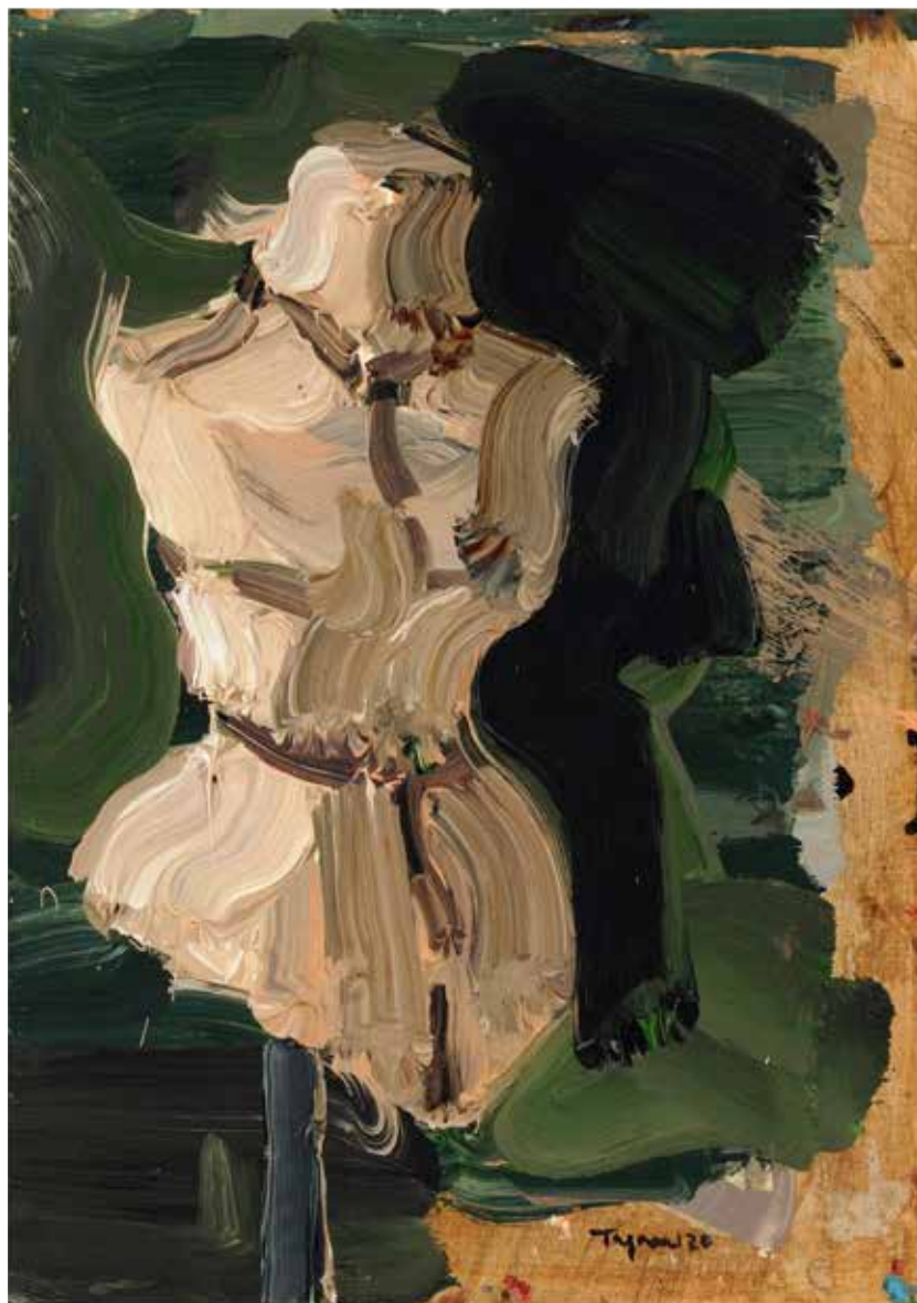
From the series Floral Dummies (2020) Acrylic on paper mounted on canvas, 42 x 30 cm