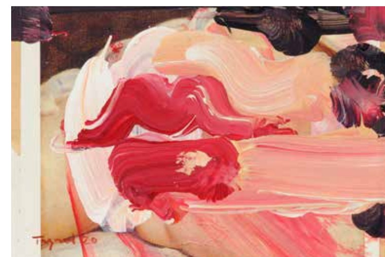
From the series A tribute to Asger Jorn (2020) Acrylic on postcard, 10 x 19 cm