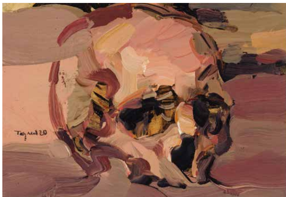
From the series Lips & Skulls (2020) Acrylic on paper, 21 x 30 cm