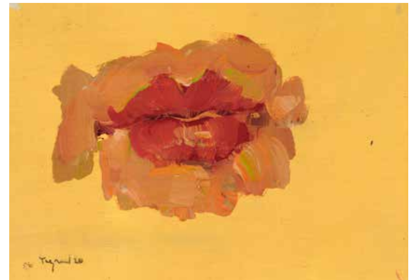
From the series A tribute to Asger Jorn (2020) Acrylic on postcard, 10 x 19 cm