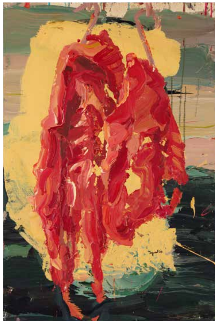
Piece of Meat (2020) Acrylic on canvas, 60 x 50 cm