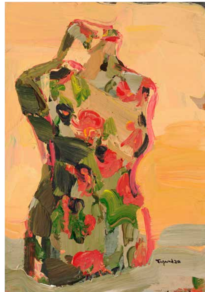
From the series Floral Dummies (2020) Acrylic on paper mounted on canvas, 42 x 30 cm