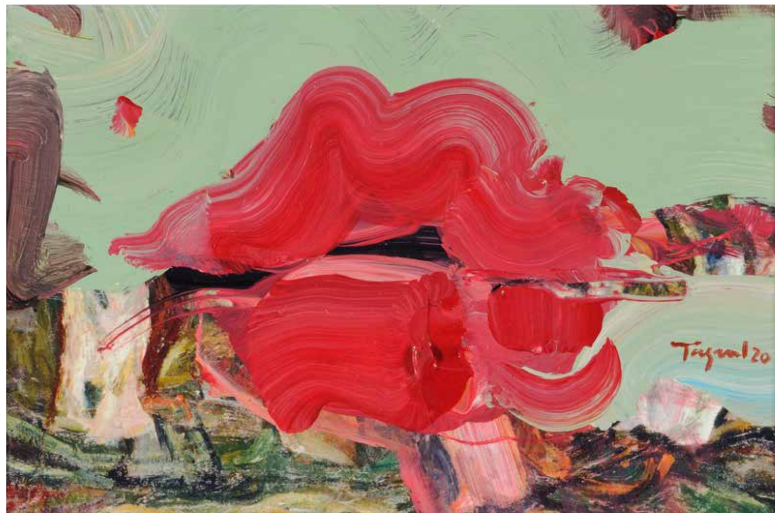
From the series A tribute to Asger Jorn (2020) Acrylic on postcard, 10 x 19 cm