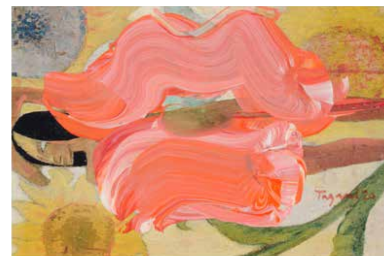
From the series A tribute to Asger Jorn (2020) Acrylic on postcard, 10 x 19 cm