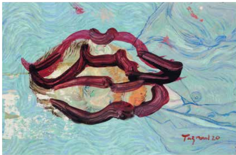
From the series A tribute to Asger Jorn (2020) Acrylic on postcard, 10 x 19 cm