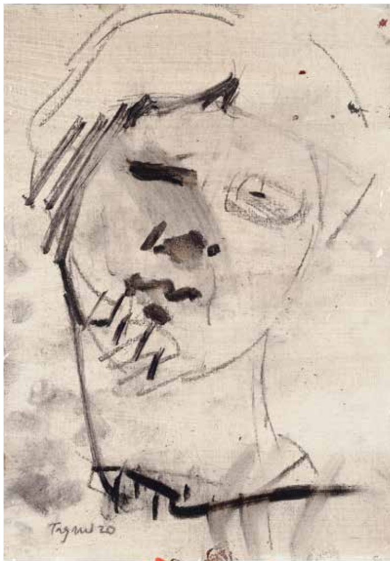
From the series Venuses & Aphrodites (2020) Charcoal on paper mounted on canvas, 30 x 21 cm