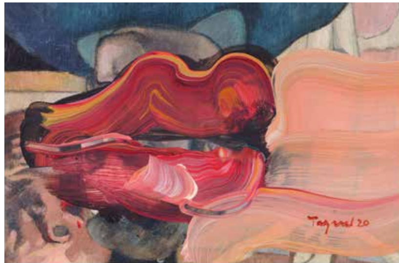
From the series A tribute to Asger Jorn (2020) Acrylic on postcard, 10 x 19 cm