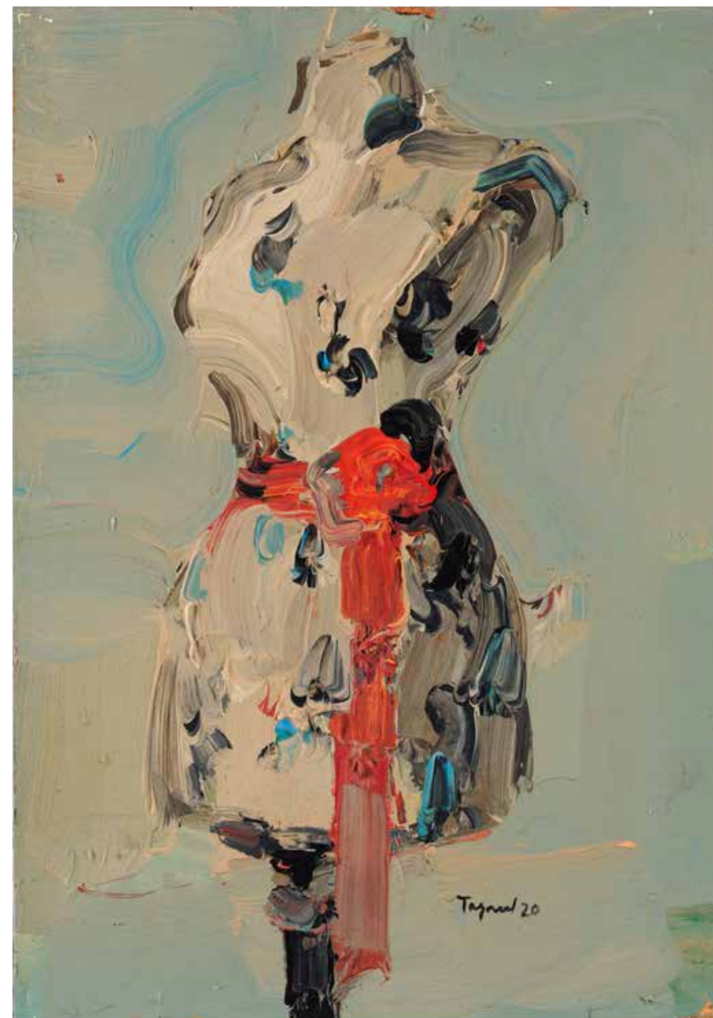
From the series Floral Dummies (2020) Acrylic on paper mounted on canvas, 42 x 30 cm